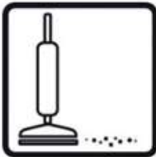
Clean area using vacuum equipment