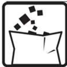
Waste should be disposed of according to local regulations