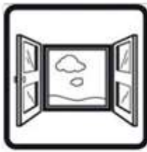
Ventilate working area if possible

"The mechanical effect of fibres in contact with skin may cause temporary itching"