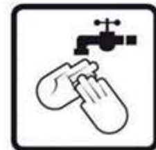
Rinse in cold water before washing