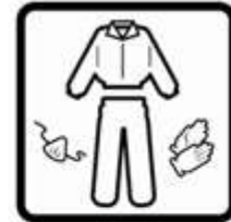
Cover exposed skin. When working in unventilated area wear disposable face mask